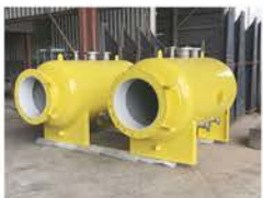
ASME Steel Pressure Vessels Heavy wall tanks ranging from 36" to 192" diameters