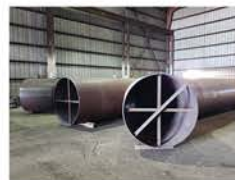
Rolled and Welded Steel Pipes