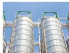
Steel Bulk Storage