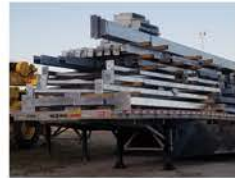
Structural Steel Fabrication