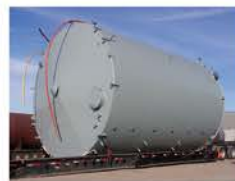
API Shop Fabricated Tanks